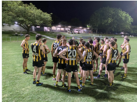
Thirds get their season up and going for 2024 at

The Thirds got into the action for the first time in 2024 with a home game practice match on Friday night against the Redland Victoria Point Sharks.