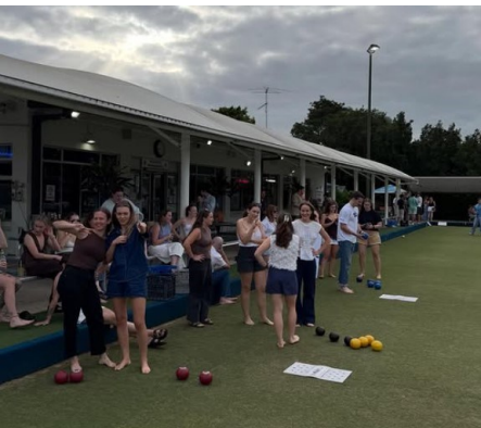
The Womens team finished their team preparations day with a game of lawn bowls.

They will then play their Round 1 at the Den rounding out a triple header with the Seniors and Reserves against Sandgate on Anzac Day 25th April at 4.45pm.