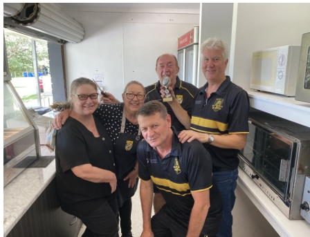
The Gardner Canteen Crew were in action yesterday at the Den.

A big thank you to all the wonderful volunteers who sprang into action this weekend after the late change to the venue for the Seniors, Reserves and Thirds playing UQ.