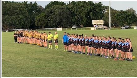
The Tigers and Swans recognise Anzac Day at Pine Rivers yesterday.