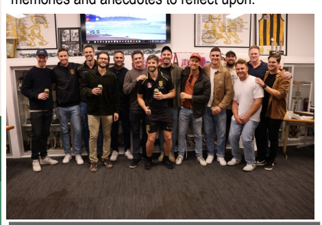
The 2015 Senior Premiership team.

Both spoke about the 2015 playing group with some wonderful and sometimes colourful memories and anecdotes to reflect upon.