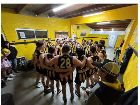
The Thirds sing out Tigerland loud and proud on Friday night after their win over the Yeronga Devils.

The support play around the stoppages also showed that communication is at a high for this time of the season and the Tigers can look forward to some consistent efforts as the season progresses.