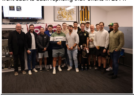
The 2015 Reserves Premiership team.

The day culminated with a recap of events some ten years ago when the Seniors and Reserves went back to back reprising their efforts in 2014.