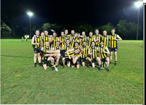
A very happy Thirds team after their win over the Yeronga Devils.

The very fleet of foot Cooper Westerhuis was streaming out of the middle kicking the Tigers deep into attack while up front Hayden Wilson was creating havoc with his strong leads and marking. He finished the night with five goals in a