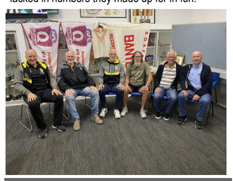
The 1975 Banyo Bloods line up.

The Bloods were a little down in numbers due to illness and the difficult weather but what they lacked in numbers they made up for in fun.